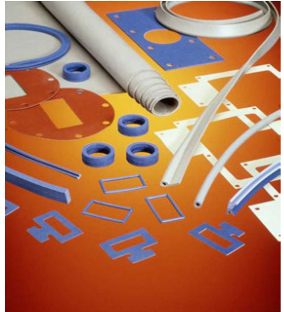
Figure 4: Conductive Elastomer

Elastomers, (Figure 4.0) each conductive elastomer consists of silicone, fluorosilicone or EPDM binder with a filler of pure silver, silver plated Copper, silver plated nickel, silver plated aluminium, silver plated glass or a nickel plated graphite. A very popular and very often used material is the Cho-Seal 1285 (silver plated aluminium) material of choice in high end military corrosion environments where corrosion and shielding of 95-100 dB is required. The nickel plated graphite Cho-Seal S6300 series are the best choice for commercial applications requiring good performance in moderately corrosive environments. Material of choice for large finishes due to the hardness of the particles to penetrate trough finishes to achieve good electrical contact