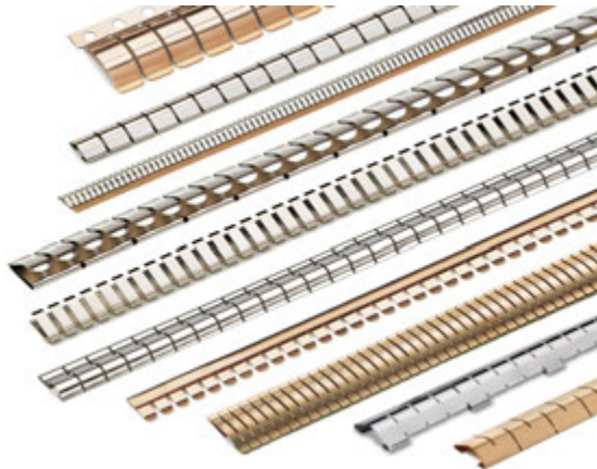
Figure 3: Beryllium Copper

Beryllium Copper fingerstock BeCu (Figure 3.0) is a high performance metal which can be fabricated in a wide variety of standard and custom build components. Its mechanical and electrical properties make it the perfect material to EMI shielding products. The benefits of Beryllium Copper are High electrical and RF conductivity, excellent plating compatibility, maximum spring performance. The Beryllium Copper parts are available in a wide variety of plating finishes.