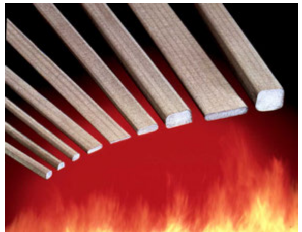
figure 1: Fabric over foam

Conductive fabric over foam makes sense where no environmental seal, complex profile or demanding mechanical durability is required. Soft-Shield 3500 (Figure 1.0) material is a Nickel Plated Copper taffetta fabric this is a low cost closure force competitive solution for EMI shielding and electrical grounding. Softshield 3500 typically requires less than 1Lb/In (0.175 /mm) closure force, making it effective for low closure force applications. Softshield 3500 is an excellent alternative shielding solution to traditional Beryllium Copper.